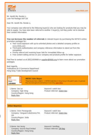
Sample of buyer list

Advertisers receive an average of more than 100 buyer contacts from a single trade fair